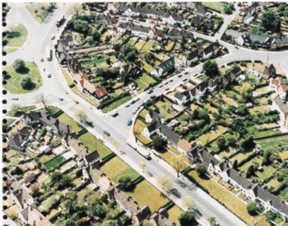
Image 7 - Aerial photograph, looking south west. Well Hall Road roundabout at left, with Well Hall Road running to bottom right; junction with Dickson Road at centre of photograph.